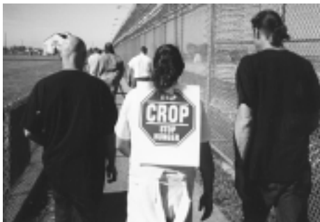
CROP Walkers at NCCF wanted to make sure everyone knew why they were walking.