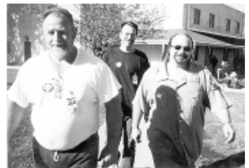
Walking for world hunger puts a look of joy on anyone's face, especially at NCCF.