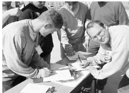
Twenty-six inmates signed up to walk in the 2000 CROP Walk at FDCF.